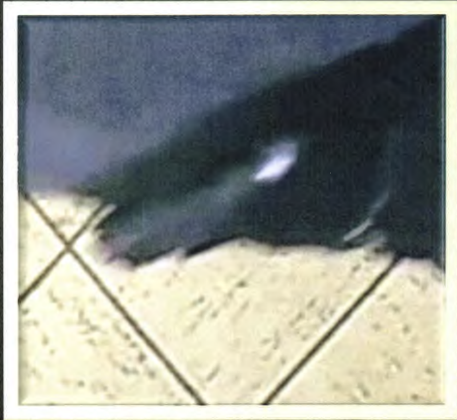
Actual firearm removed from Harris' vehicle